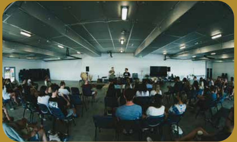
WEEKEND AWAY {MARCH 12-14}