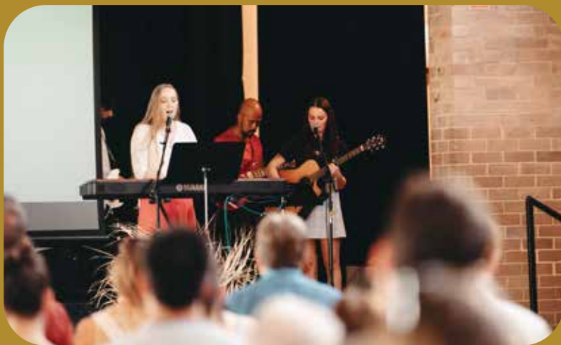
HIGH SCHOOL TRIAL {21 MARCH}