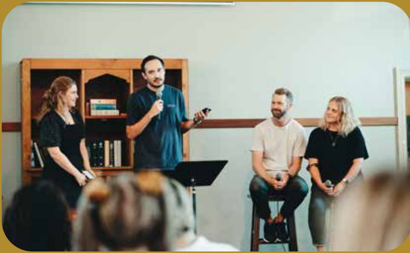
COMMISSIONING SERVICE {FEB 07}